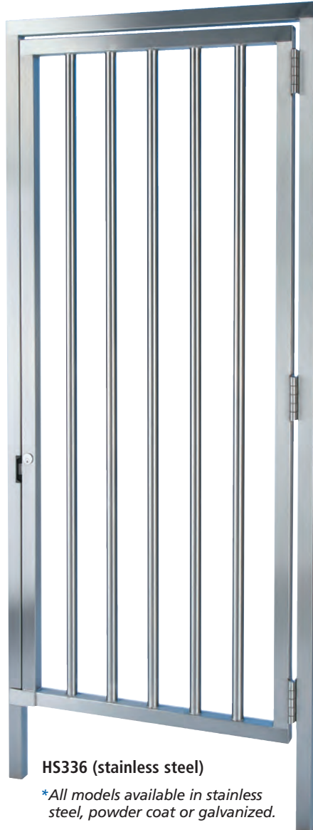
HS336 (stainless steel)

*All models available in stainless steel, powder coat or galvanized.